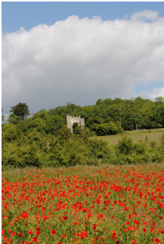
The folly at Slindon

Bob will explore the wildlife that links the estate to the surrounding landscape and the team's work in maintaining and improving habitats for generations to come.