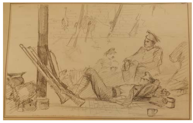
'After the Trenches. A rest.' (W.S.R.O. Add Mss 25003)

Similarly, on the following page is an extract of the text as it appears in the original document. In it, Ralph describes the scene on a typical evening in billets where men relaxed cheerily with one another before slipping off into a well earned sleep.