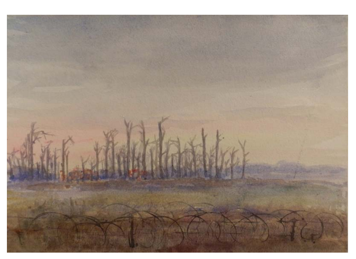
'Remains of a small wood near Vermelles' (W.S.R.O. Add Mss 25004)

"So we came to Lillers and rested again beyond on a spur of high ground that was dressed in a gay little frock the fashion of our Sussex Downs, of fine grasses and little flowers and untired men – boys – pack free, unable to rest awhile quietly, gambolled, throwing clods of clean