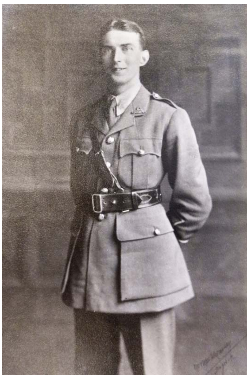
W.S.R.O. Lib 13733