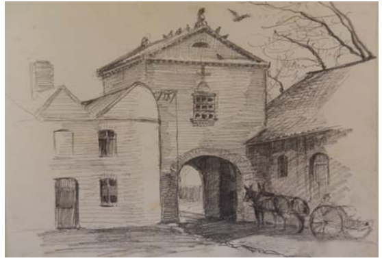
'Entrance to farm, Noyelles'

many miles of trenches during the day, but always returning at night to the large farmhouse at Noyelles. All the rooms were fully occupied, but to my surprise I discovered that a large cupboard, a fixture on the landing was empty. On the bottom shelf of this, with doors almost closed, I slept undisturbed and comfortable. At the end of my stay it was eagerly sought after by another tenant of the farmhouse." 11