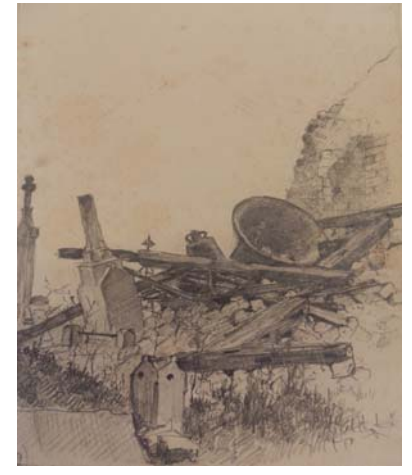
'Remains of a Church, Agny'

never goes into any detail about his own specific role, it does seem that his ability as an artist led to him being used for observation purposes as he was able to make quick and accurate sketches of the enemy lines. He visited a range of observation posts in order to achieve this, seeing much more of the Western Front then many other soldiers would have done. Many of the sketches and paintings included in his memoirs come from the time he spent in these observation posts, as well as from time spent in billets and towns behind the lines. The drawings he made would often be of a desolate landscape scarred by warfare, either barren countryside or buildings that had become crumbling ruins (see pictures). This is probably one of the most enduring images of