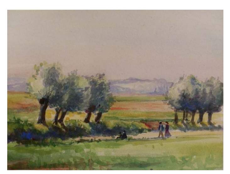
'Near Allouagne' (W.S.R.O. Add Mss 25005)

earth and grass at each other and laughed again."9