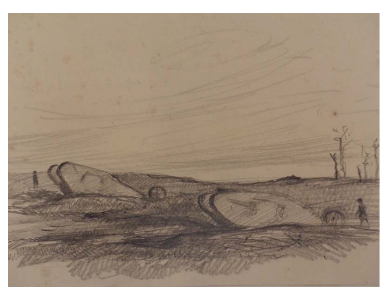
'Tanks coming out of action' (W.S.R.O. Add Mss 25006)

"We had seen the tanks stationary, a stolid looking mass of metal, but as they went up or came out of action seeing them slowly thrusting forward through the mud, nosing and feeling their way into and over deep shell hole and portions of deep trenches, there was no sense of ordinary mechanical